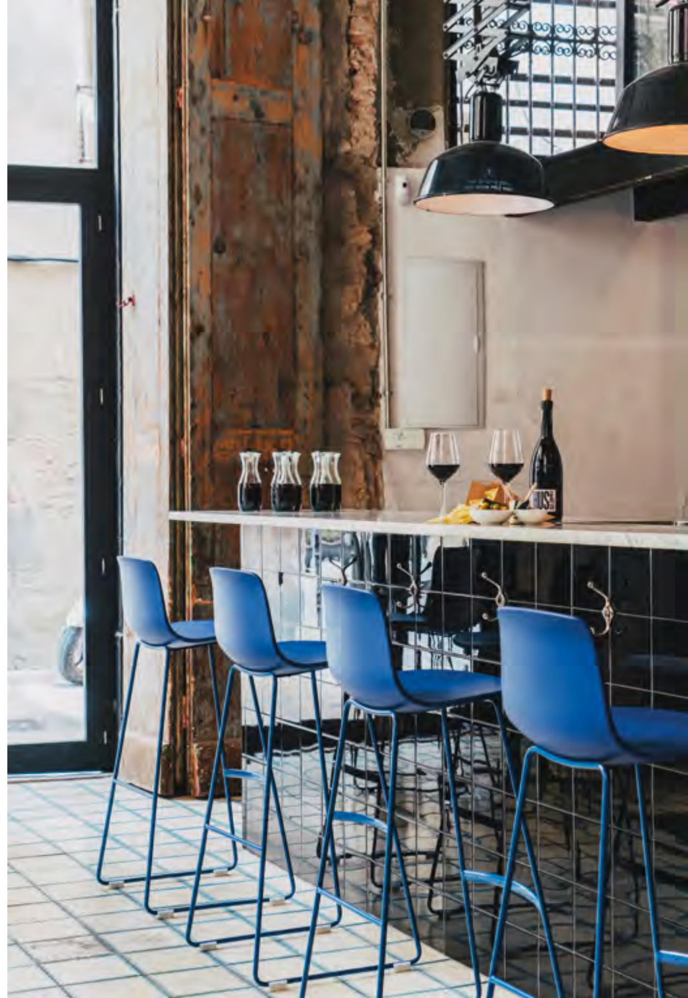
On the right: Lottus stool (ref. 4752) in Pantone 7545C monochrome.