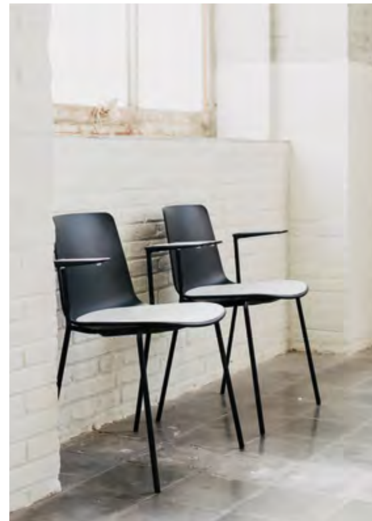
Lottus chair (ref. 4800) lacquered and PP shell in RAL 9005 with RAL 7004 pad.

Gracias a la amplia gama de materiales y acabados, Lottus es tan diversa como nuestros clientes.