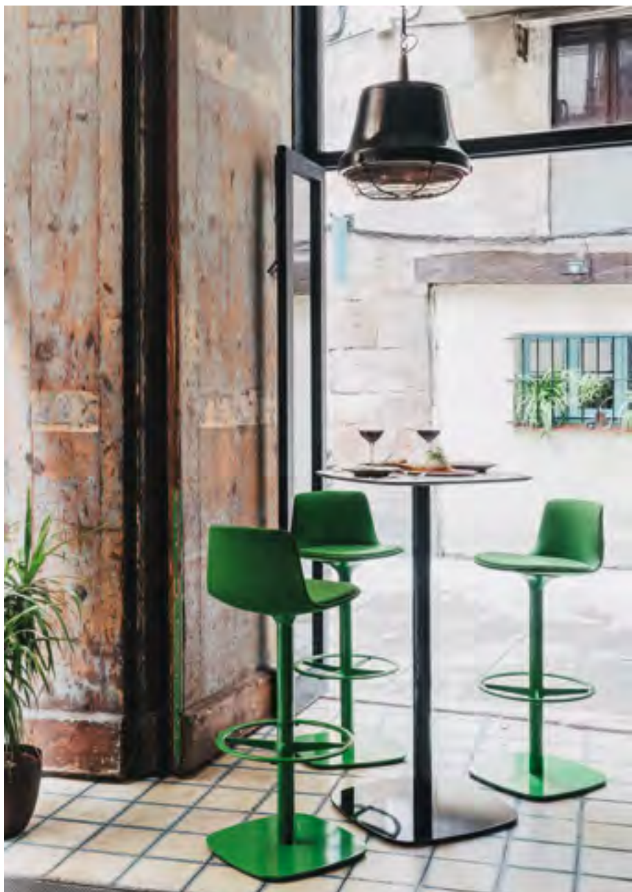
Lottus stool (ref. 4700) with a structure and PP shell in custom colour and pad upholstered with Lottus table.