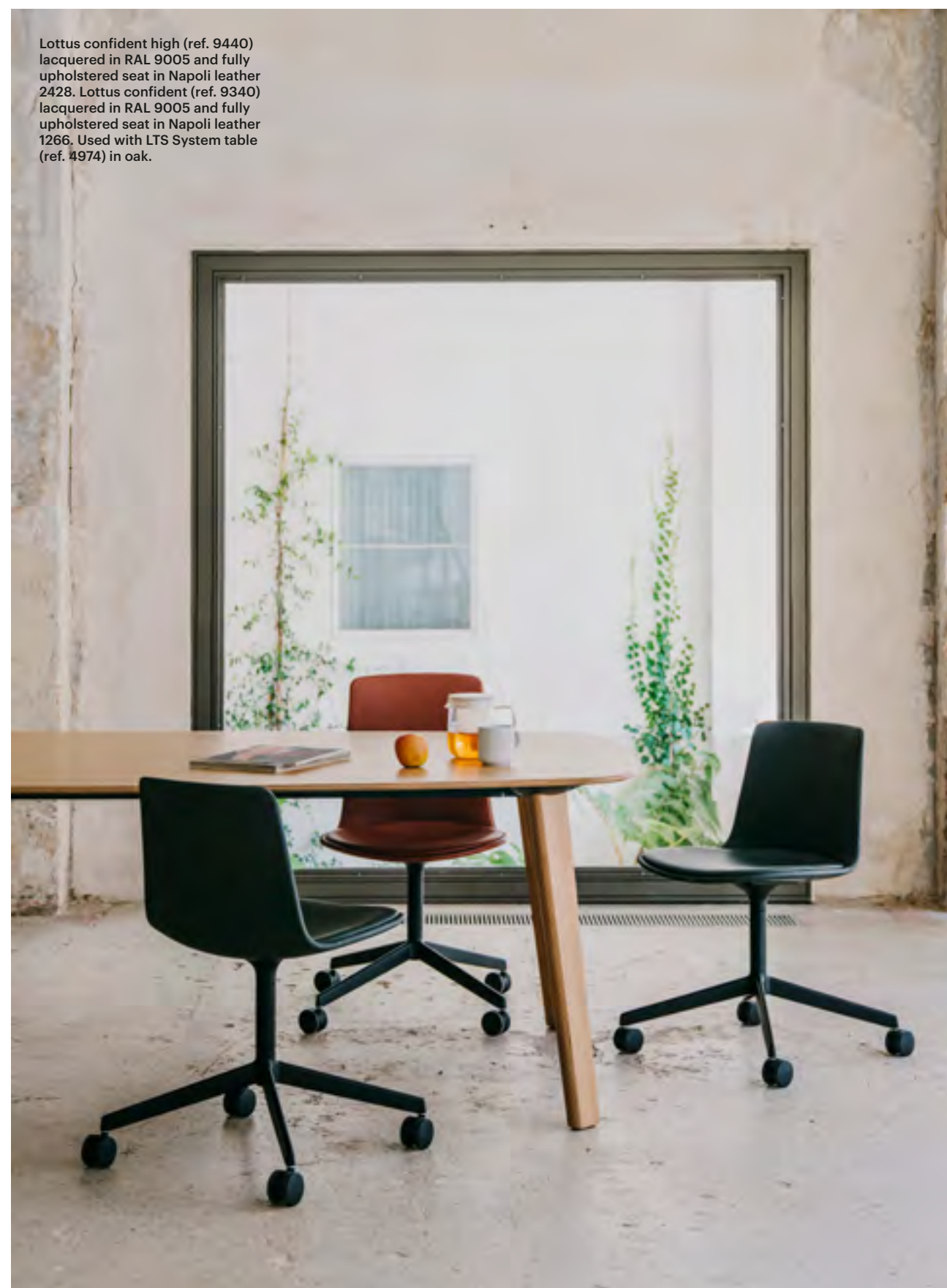
Lottus confident high (ref. 9440) lacquered in RAL 9005 and fully upholstered seat in Napoli leather 2428. Lottus confident (ref. 9340) lacquered in RAL 9005 and fully upholstered seat in Napoli leather 1266. Used with LTS System table (ref. 4974) in oak.