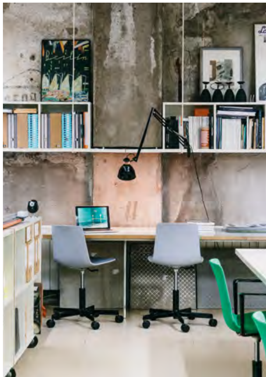
Lottus office chair (ref. 5309) in RAL 9005 structure, shell in RAL 7004 PP and pad upholstered in Step 60092. Lottus office chair (ref. 5300) with arms and base lacquered in RAL 9005 and fully upholstered seat.

Con su resistente base con ruedas, más adaptable al entorno de oficina, Lottus resulta ideal para los espacios de trabajo.