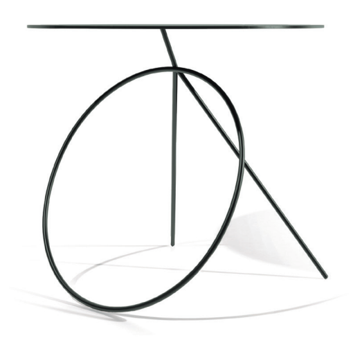
Table that perfectly represents the symbiosis of sculpture and balance.

Composed of a metal tabletop and a base comprised of a circle and two metal rods that evokes the "slashed O", the emblem of Brazilian designer Pedro Paulo-Venzon.