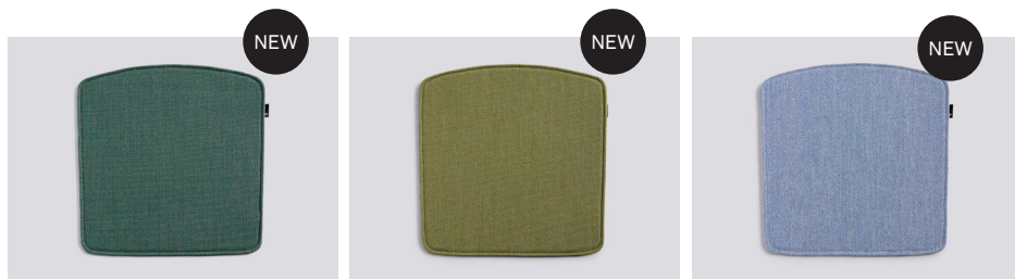
Steelcut Trio 966 (Smokey green)