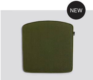
Outdoor Olive (Olive)