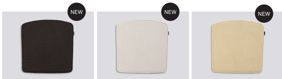
Steelcut Trio 383 (Anthracite)