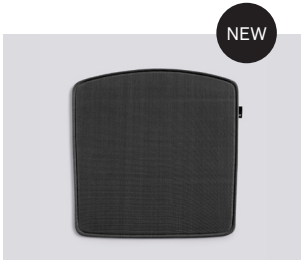
Outdoor Anthracite (Anthracite)