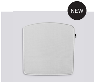
Outdoor Sky grey (Light grey)