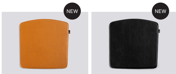
Sofia Cognac leather