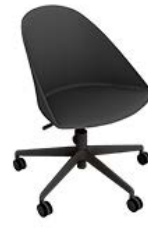
3 Armchair with castors