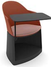
2 Chair with castors