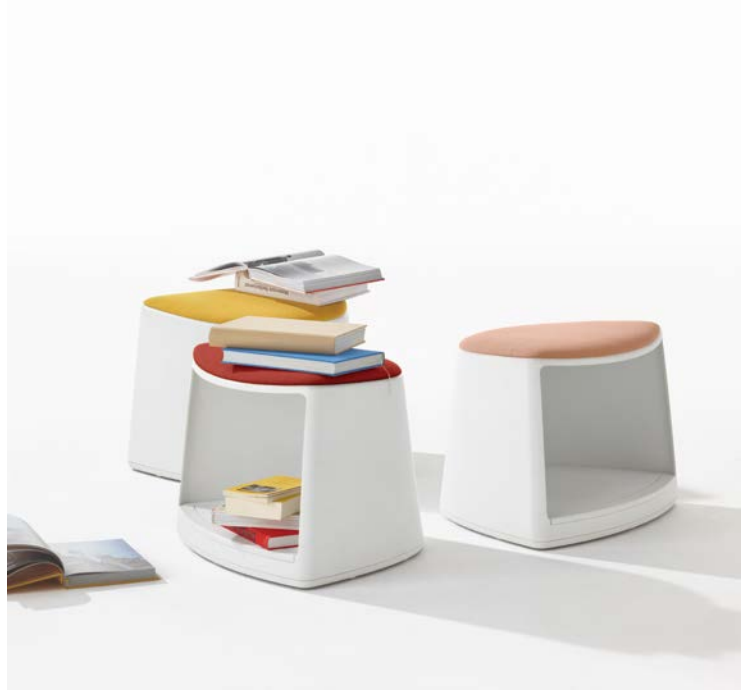
1 Cila Go Stool Art. 2300