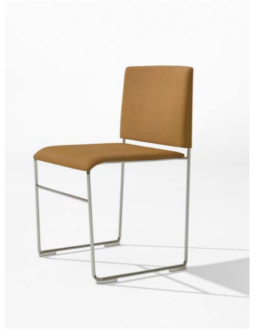
1 Art. 6602