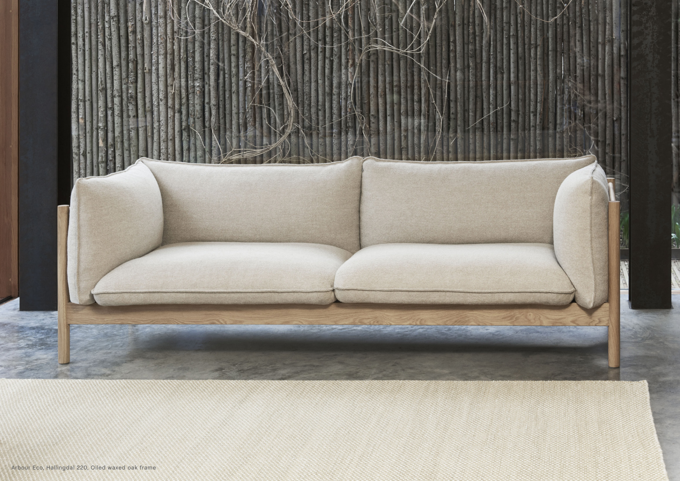
Arbour Eco, Hallingdal 220, Oiled waxed oak frame