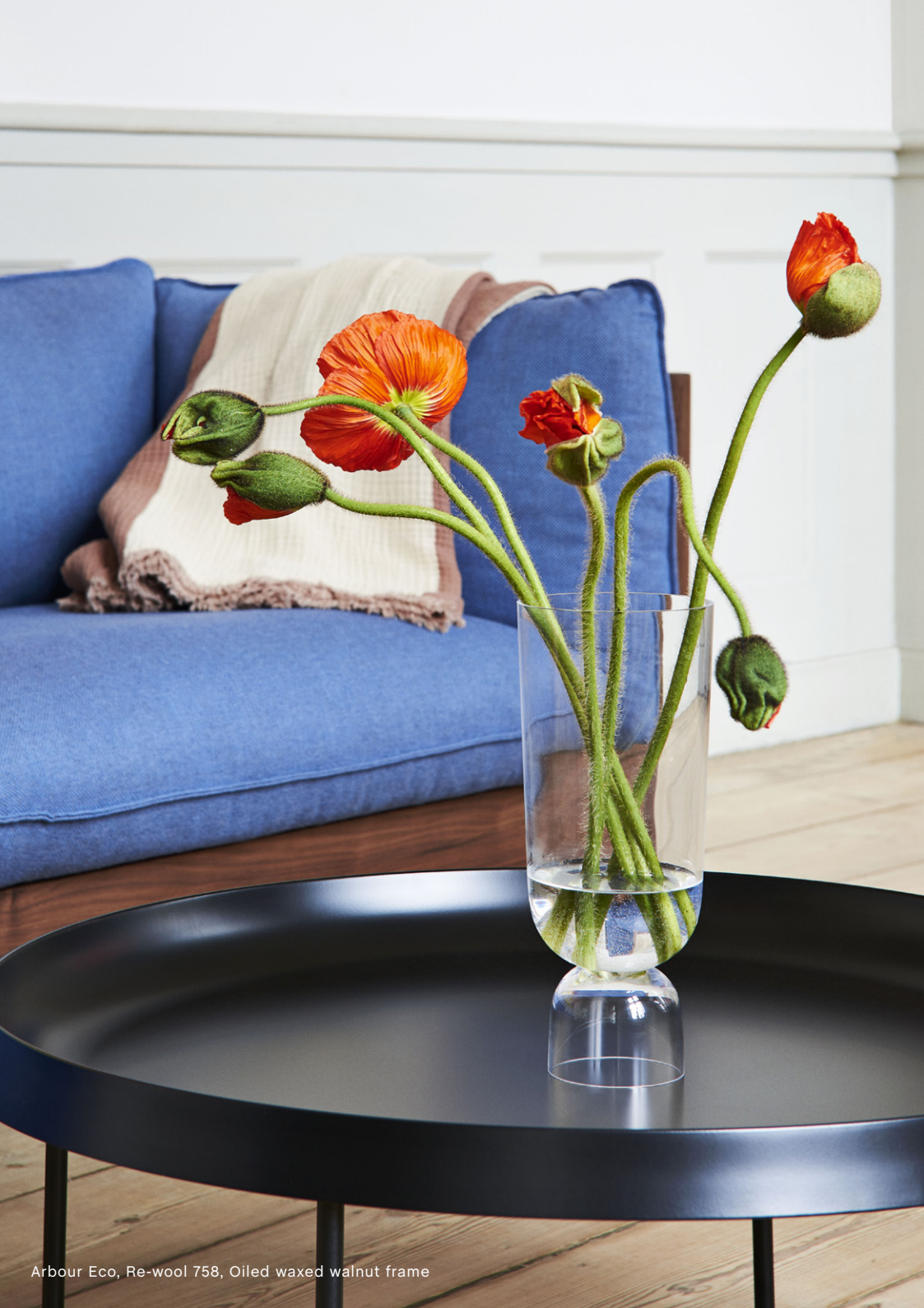
Arbour Eco, Re-wool 758, Oiled waxed walnut frame