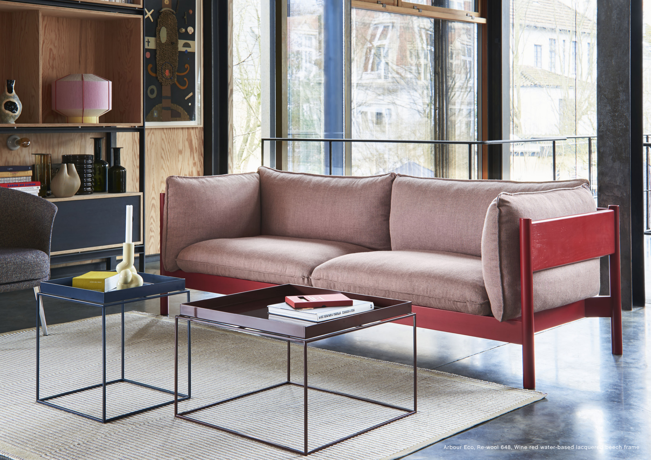
Arbour Eco, Re-wool 648, Wine red water-based lacquered beech frame