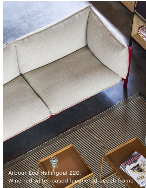
Arbour Eco Hallingdal 220, Wine red water-based lacquered beech frame