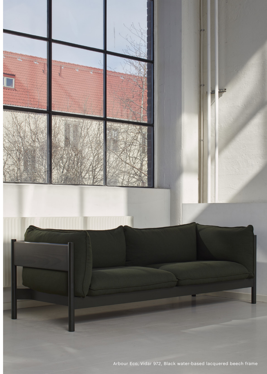
Arbour Eco, Vidar 972, Black water-based lacquered beech frame

Arbour Eco is a sofa which has universal appeal thanks to its simplicity, so it works well in many environments. Although it is relatively large, it is also light, both physically and aesthetically. Its silhouette is clean and clear, so it's suitable in a variety of settings – from an old house, where it offers interesting visual contrast, to more contemporary buildings.