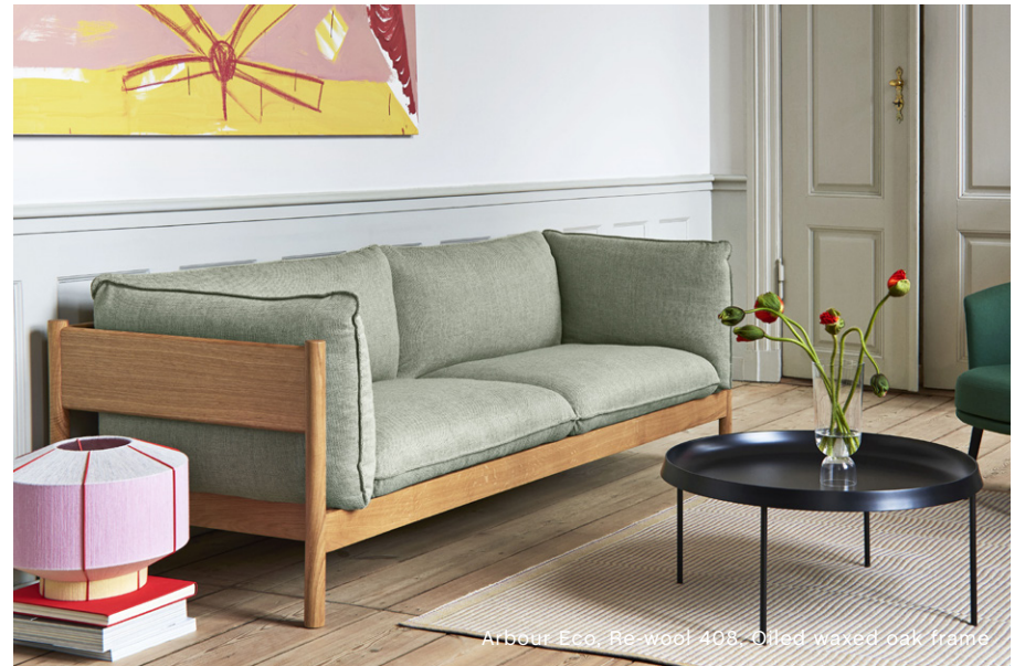
Arbour Eco, Re-wool 408, Oiled waxed oak frame