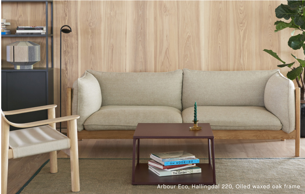
Arbour Eco, Hallingdal 220, Oiled waxed oak frame