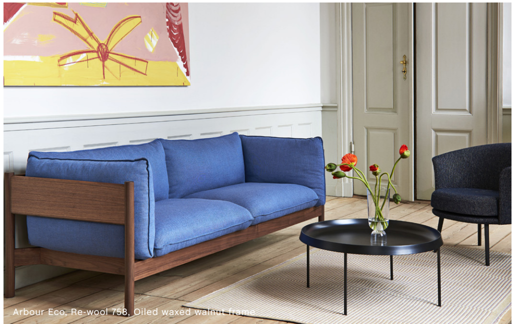
Arbour Eco, Re-wool 758, Oiled waxed walnut frame