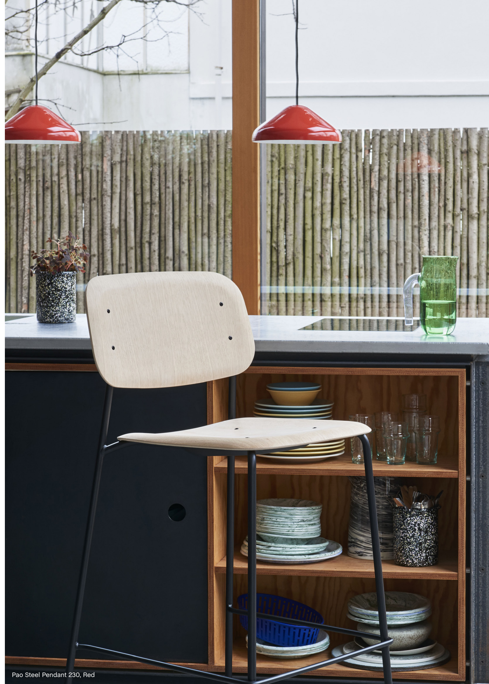
Pao Steel Pendant 230, Red