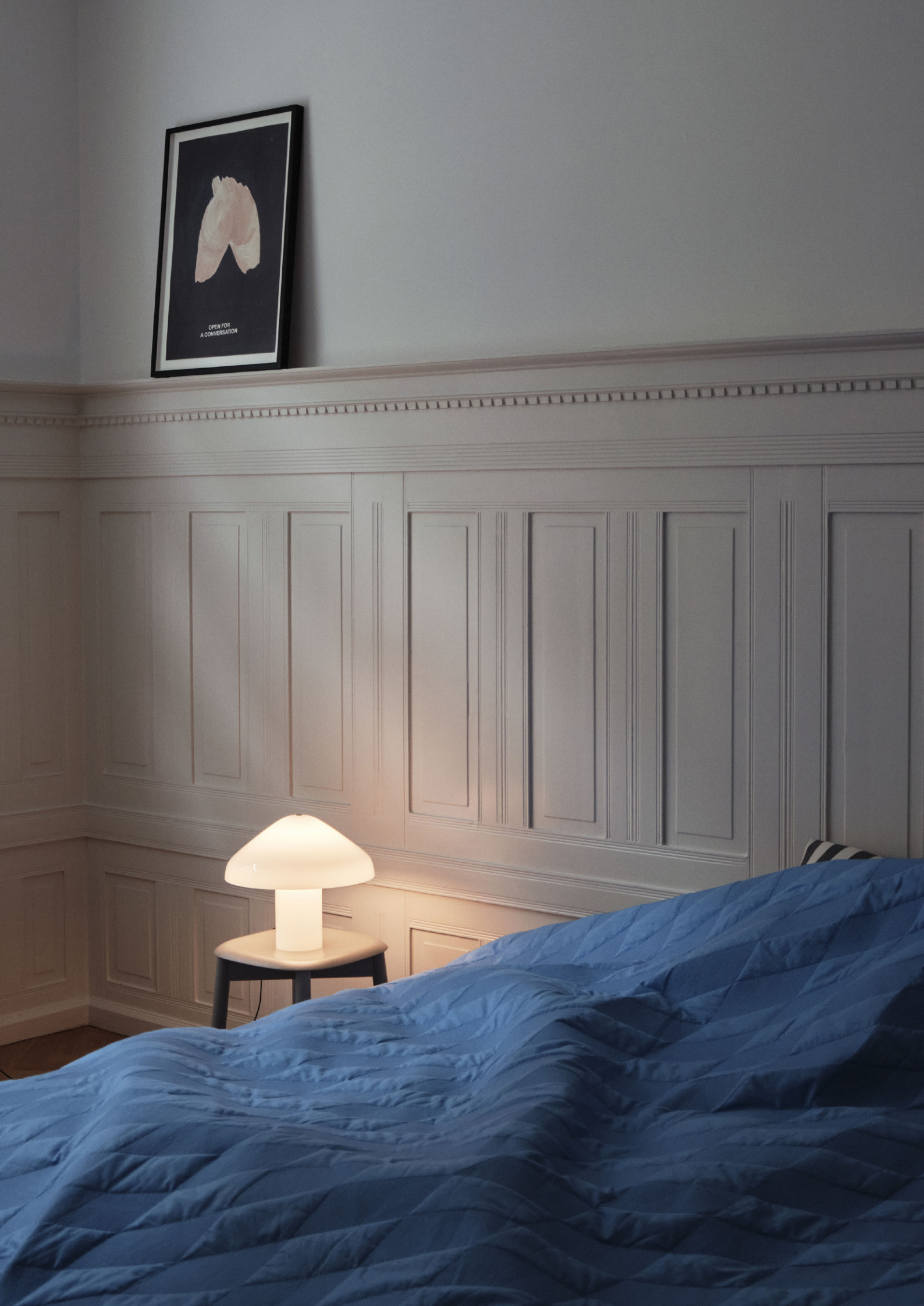
- PAO GLASS TABLE LAMP -