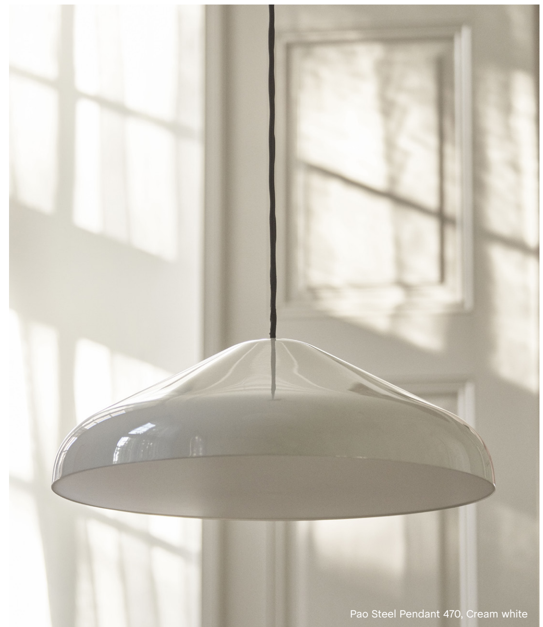
Pao Steel Pendant 470, Cream white