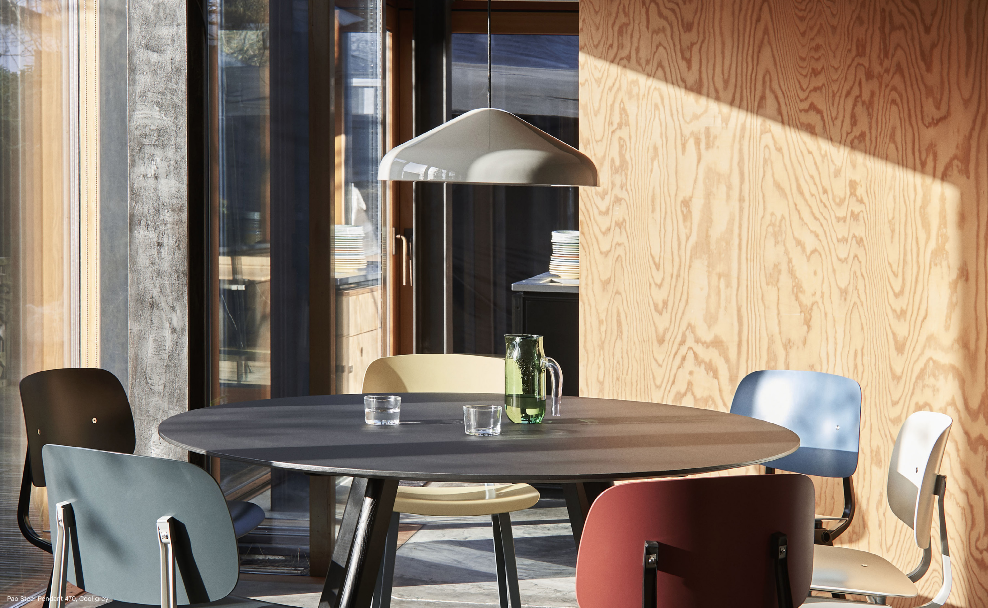
Pao Steel Pendant 470, Cool grey