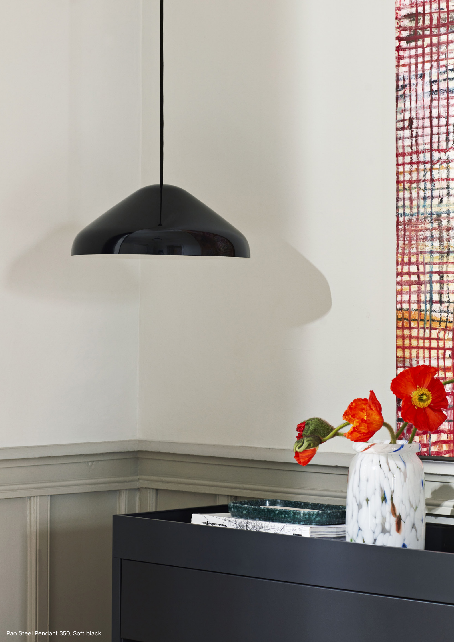
Pao Steel Pendant 350, Soft black