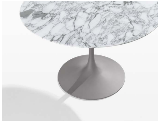
Saarinen marble table tops in Arabescato, Nero Marquina, Espresso, and Verde Alpi (right), Arabescato table top and Tulip Chairs and stool (below)

an elegant round or oval top with a refined, knife edge. This is accomplished through a unique base construction and materials that provide exceptional strength and fluidity.