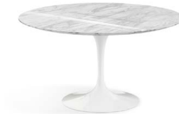
Saarinen Dining Table Round 35¾–60"W × 35¾–60"W × 28¼"H

KnollStudio® The Saarinen Pedestal Collection