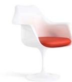
Tulip™ Arm Chair 26"W × 23¼"D × 32"H