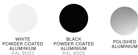
WHITE POWDER COATED ALUMINIUM RAL 9003

Please note that the colour codes are indicative.