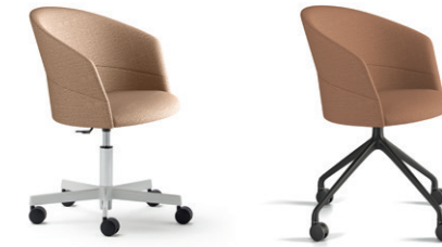
Copa chair, five casters base