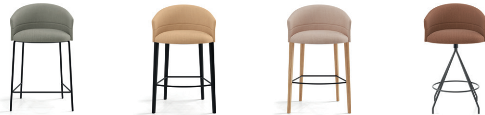
Copa counter stool, 4 metal legs