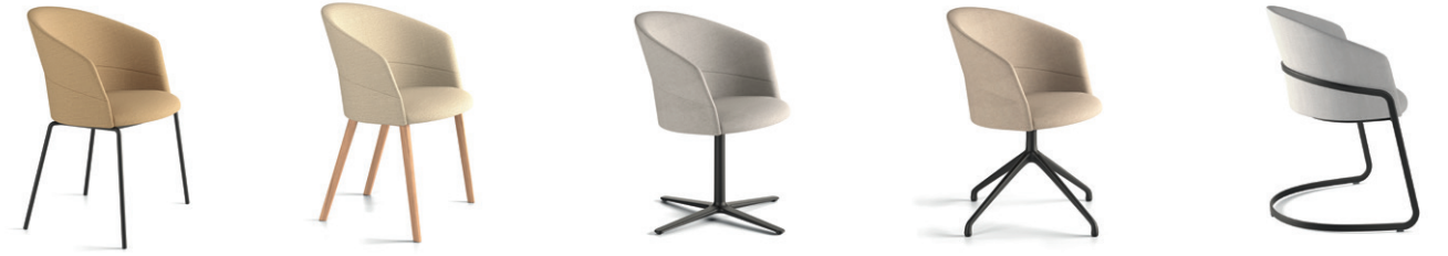
Copa chair, 4 metal legs base