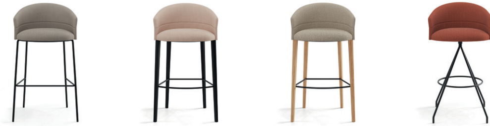
Copa bar stool, 4 metal legs