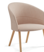
Copa lounge chair, wooden base