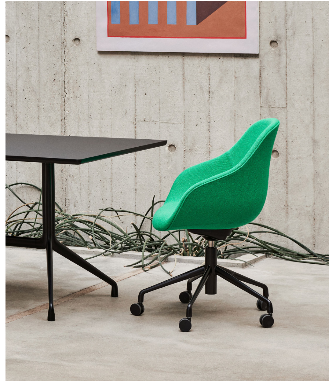
AAC 155, Vidar 932