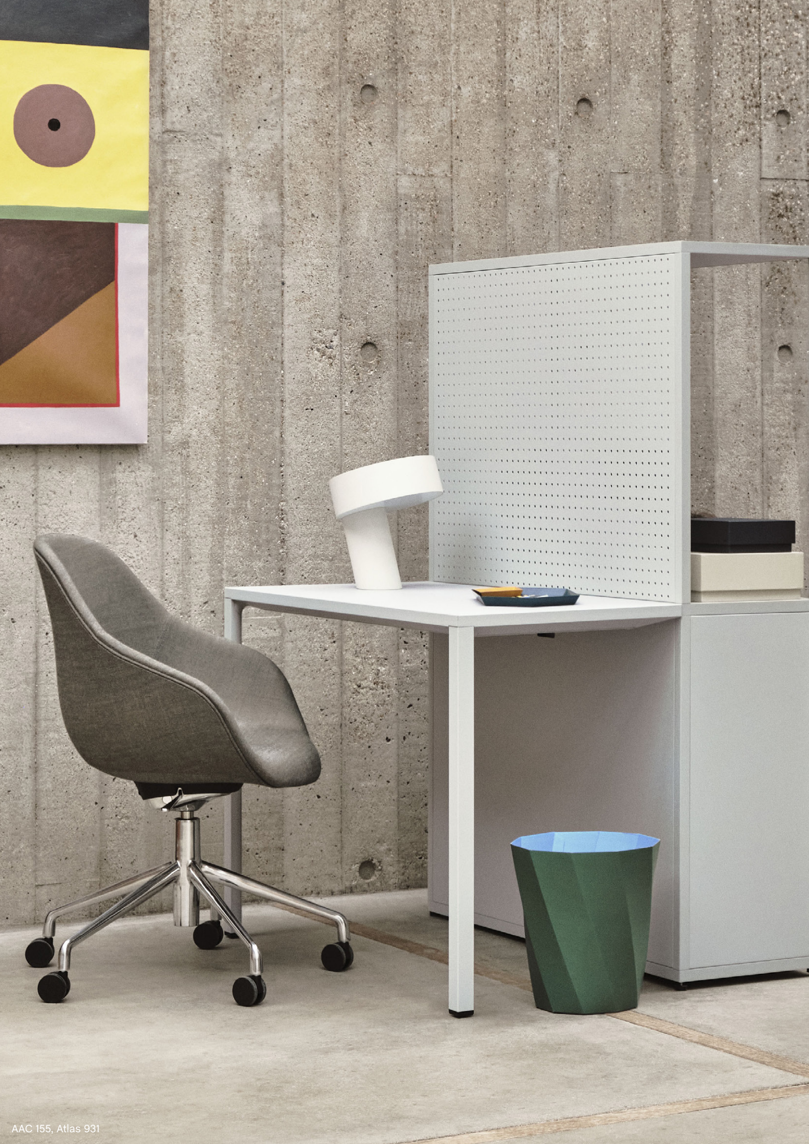
AAC 155, Atlas 931