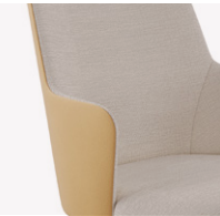
Back in leather/ecoleather