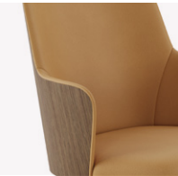
Back in wood