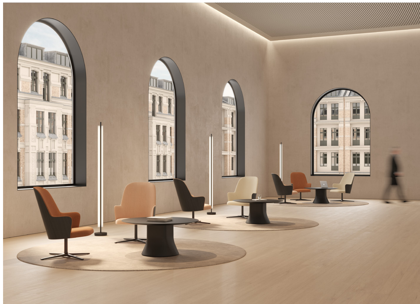
Aleta Executive Lounge and Cambio low table.

Aleta's generously proportioned seat has been designed to lounge, collaborate and get inspired every day.