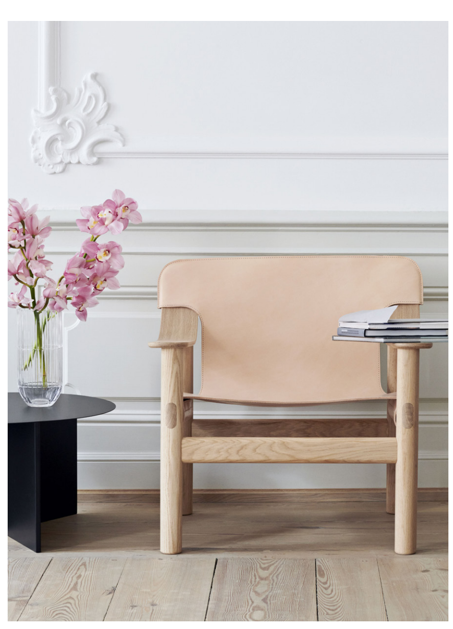
Bernard | Nature leather | Water-based lacquered oak base