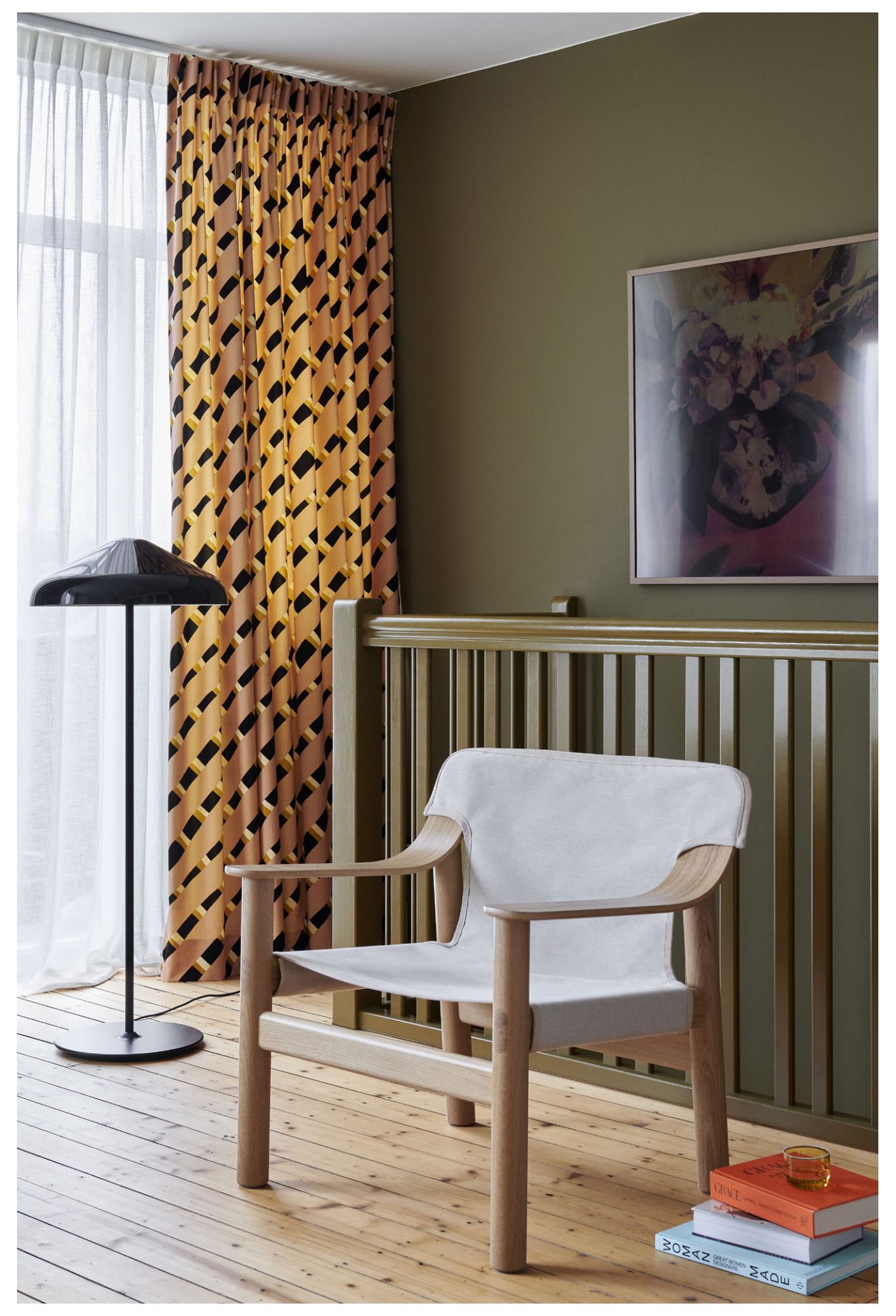
Bernard | Raw canvas cover | Water-based lacquered oak base

The juxtaposition of a solid-wood frame with a visually light cover creates a unique relationship between the two components, resulting in a comfortable and durable chair with a distinctive design language. The frame is crafted in solid oak or beech with different finishes, and the slip-on cover is available in leather or industrial-strength marine canvas.