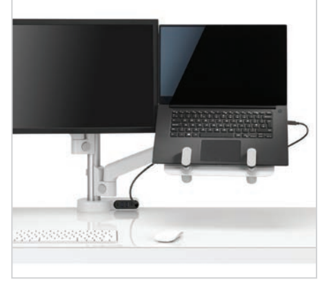
Optional Technology Support