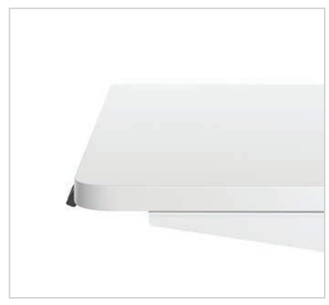
Melamine, Square-Edge Work Surface with Radius Corners