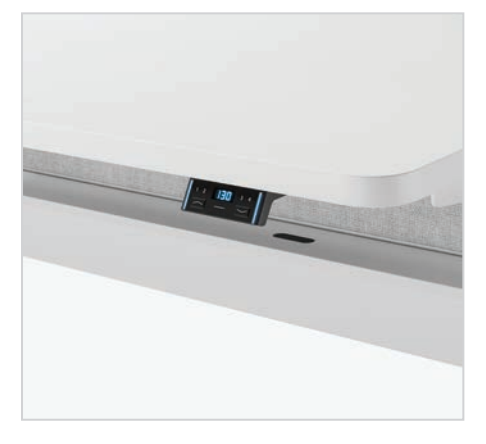
Simple Touch Switch