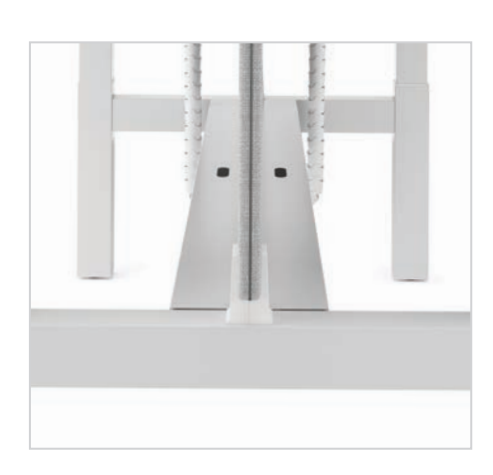
Optional Lower Cable Tray