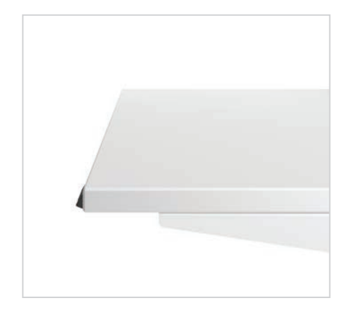
Melamine, Square-Edge Work Surface with Square Corners