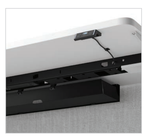
Optional Upper Cable Tray