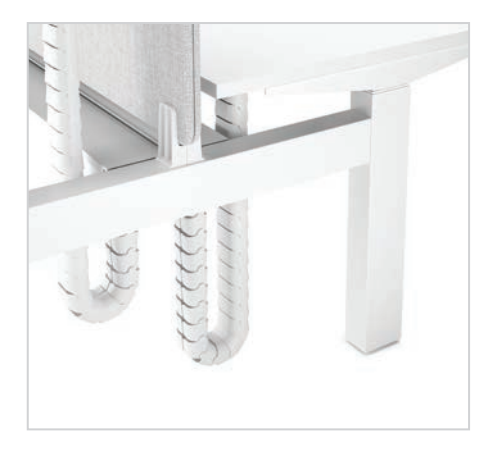
Standard or fabric umbilical cable management