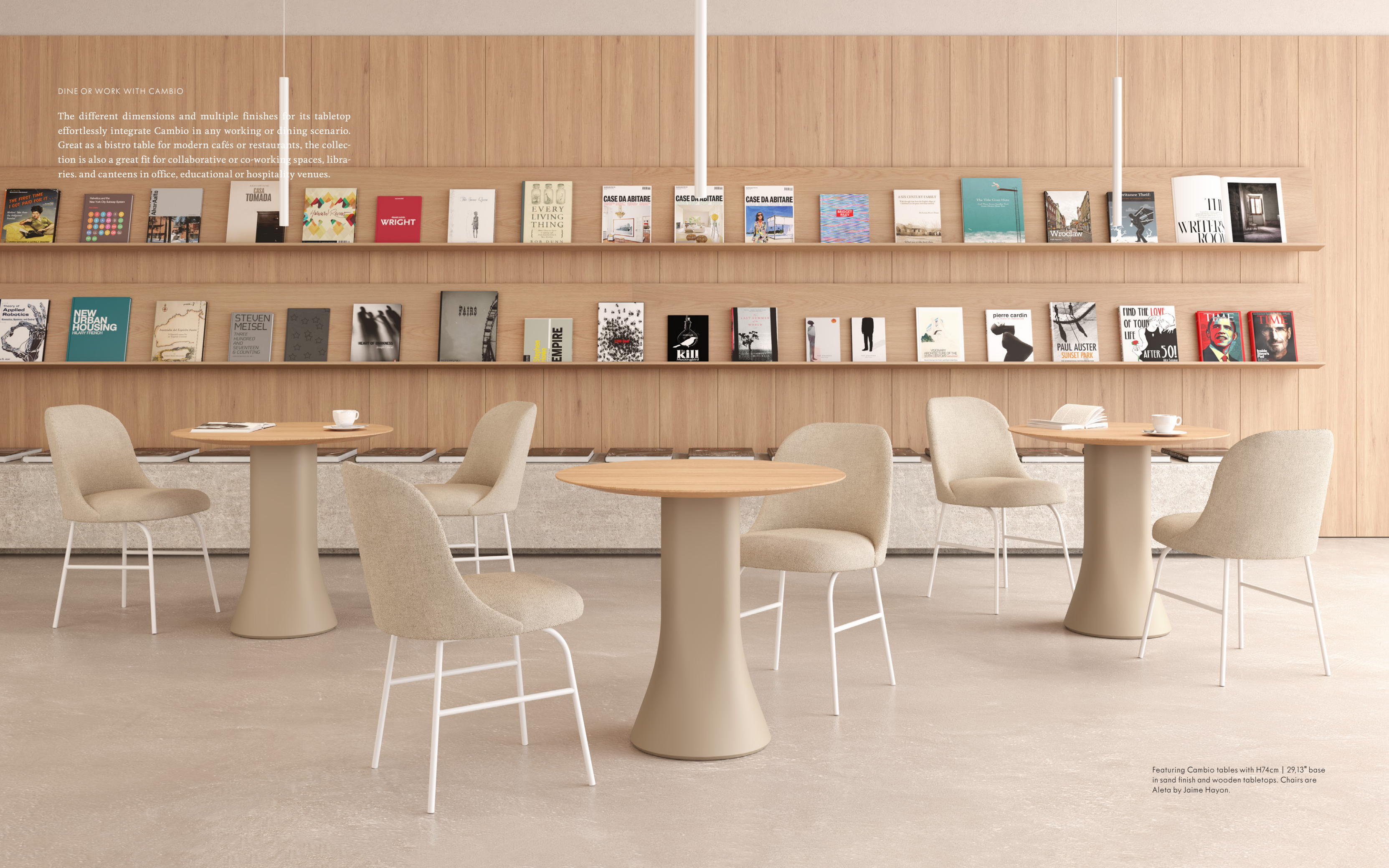
Featuring Cambio tables with H74cm | 29,13" base in sand finish and wooden tabletops. Chairs are Aleta by Jaime Hayon.

The different dimensions and multiple finishes for its tabletop effortlessly integrate Cambio in any working or dining scenario. Great as a bistro table for modern cafés or restaurants, the collection is also a great fit for collaborative or co-working spaces, libraries, and canteens in office, educational or hospitality venues.